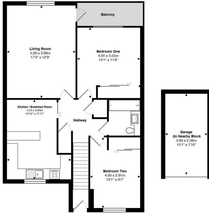
First Floor Maisonette

All measurements are approximate and for display purposes only